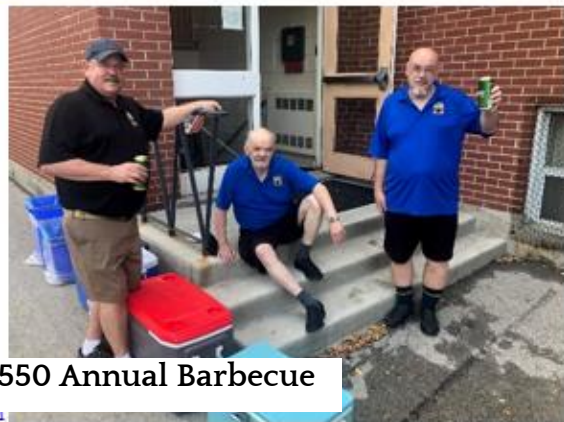
Buchanan Lodge No. 550 Annual Barbecue