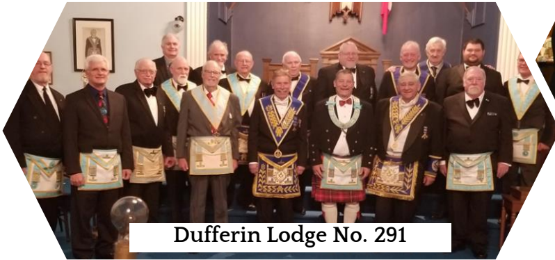
Dufferin Lodge No. 291