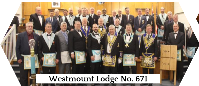
Westmount Lodge No. 671