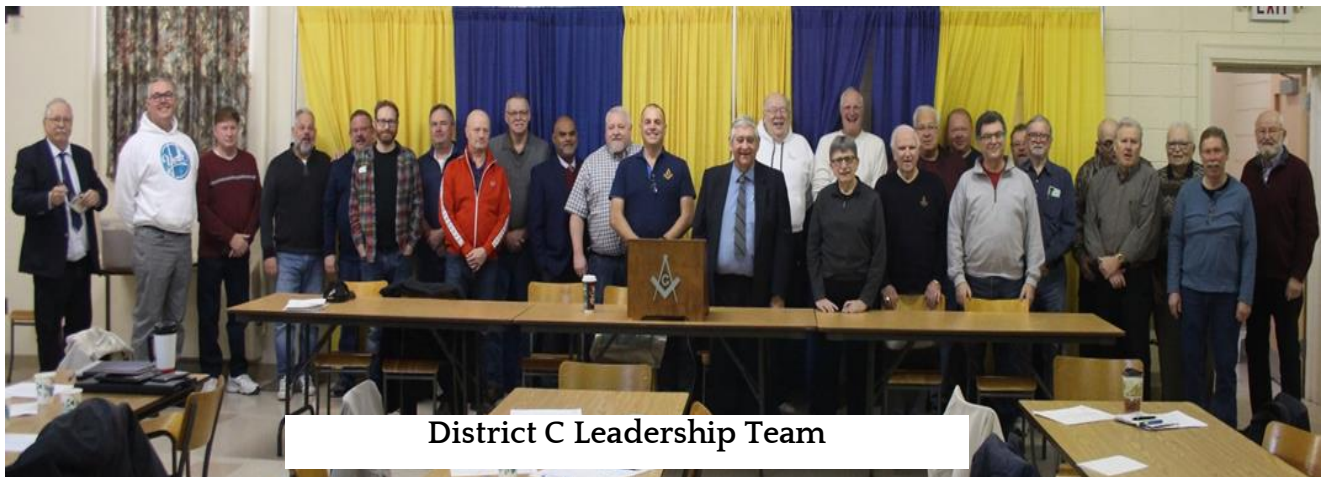
District C Leadership Team