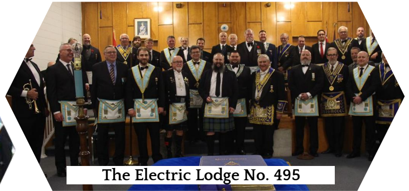
The Electric Lodge No. 495