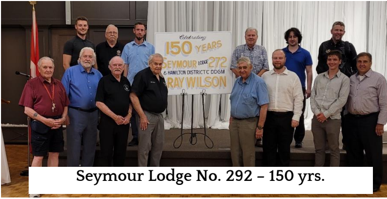
Seymour Lodge No. 292 - 150 yrs.