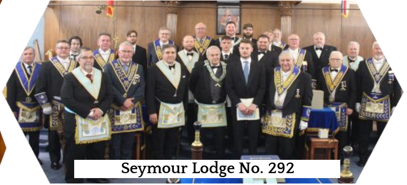
Seymour Lodge No. 292