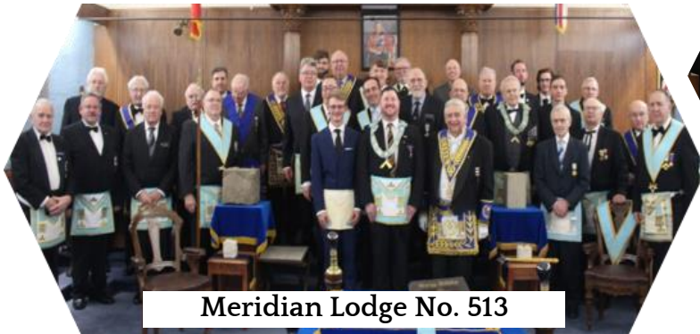
Meridian Lodge No. 513