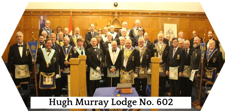
Hugh Murray Lodge No. 602