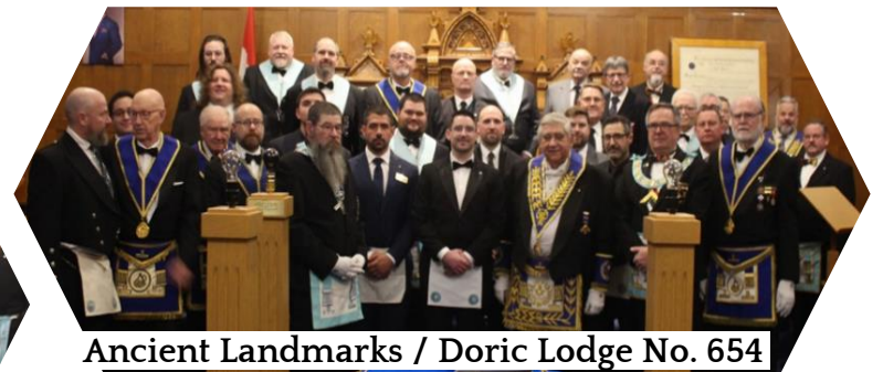
Ancient Landmarks / Doric Lodge No. 654