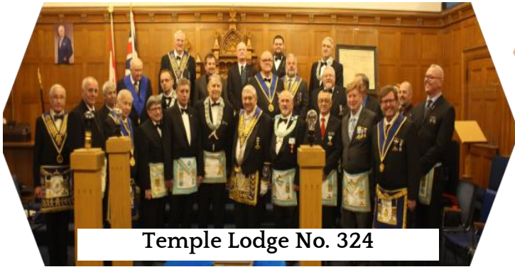
Temple Lodge No. 324