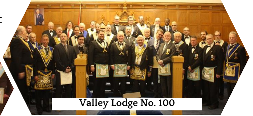
Valley Lodge No. 100